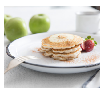
Try these snack ideas: